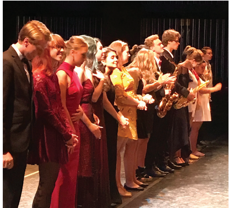
Students wait anxiously backstage before learning the results.