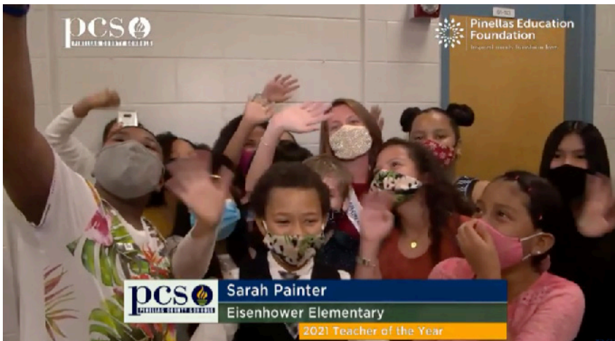
A jubilant class selfie with their new Teacher of the Year

“As they say, it takes a village to raise a child, and it takes a district to raise a teacher,” she said, following with thanks to her school administration past and present, co-workers and friends, Eisenhower school family, her students (“who have taught me more than I could ever learn”) and, of course, her husband and six children, ages 4 to 14, for all their sacrifices.