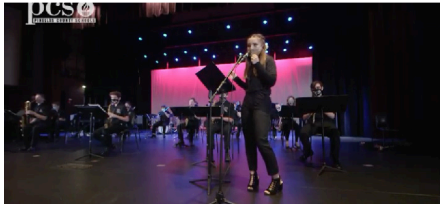
Students from the Tarpon Springs High School Leadership Conservatory for the Arts provided top-tier entertainment