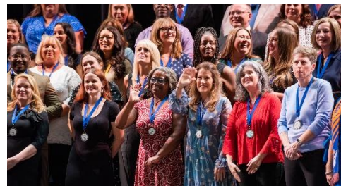
Nominees waving to the crowd