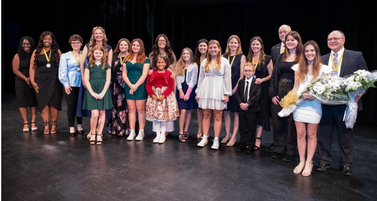
Top 10 Teacher of the Year finalists with their student presenters