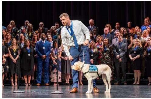
All 130 Teacher of the Year honorees introduced themselves to the crowd.